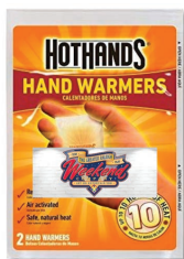
J1 - Hand Warmers $1.89 (R)/150pcs