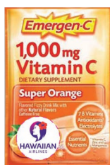
M1 - Emergen-C Packet $1.34 (R)/150pcs