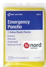
P1 - Rain Poncho $1.77 (R)/150pcs