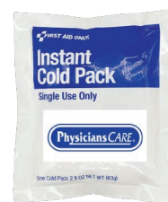
C1 - Instant Cold Pack $1.52 (R)/150pcs