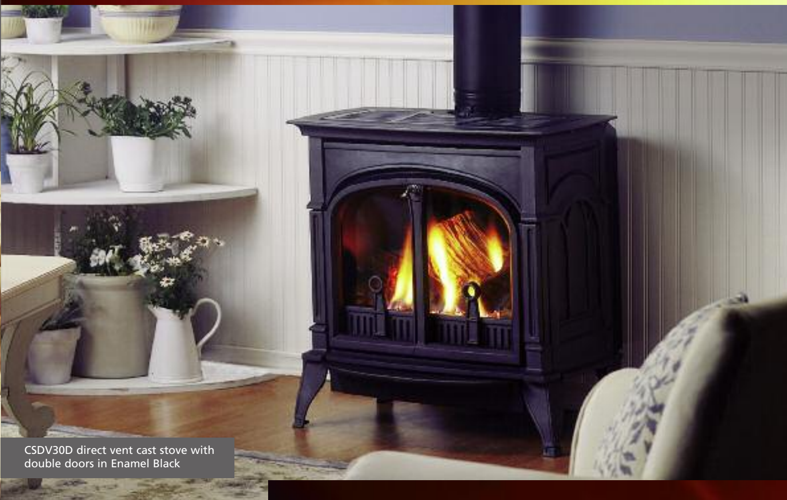
CSDV30D direct vent cast stove with double doors in Enamel Black