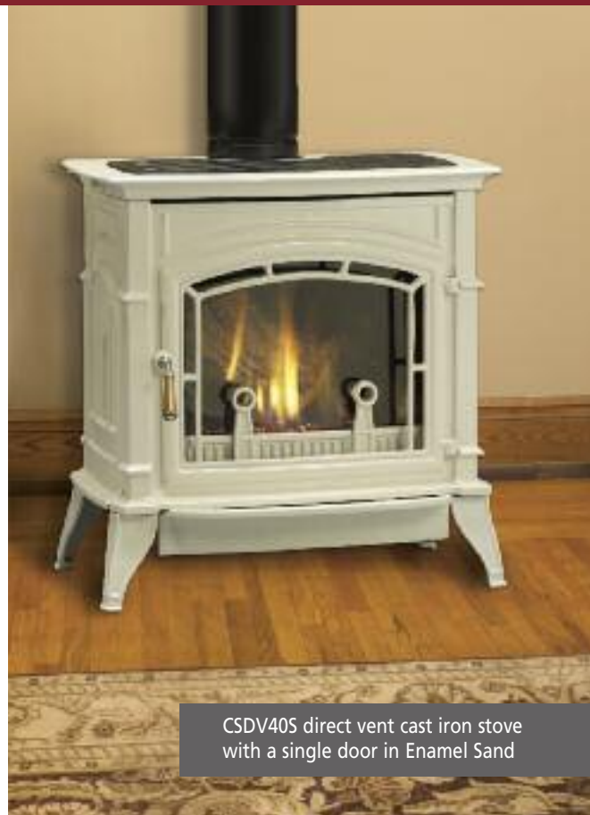
CSDV40S direct vent cast iron stove with a single door in Enamel Sand

The elegant castings of the Concorde direct vent stove are timeless in their design and complement any décor or setting. The intricate design and detailing will add character to any room. Designed with the latest direct-vent technology, this stove proves to be a clean burning, efficient heater and is easily installed into almost any room. Traditional styling combined with the warmth and ambiance of a fire make the Concorde Series direct vent gas stove a valued addition to your home. Our designers have meticulously scrutinized every detail to ensure that you receive the finest gas stove built today.