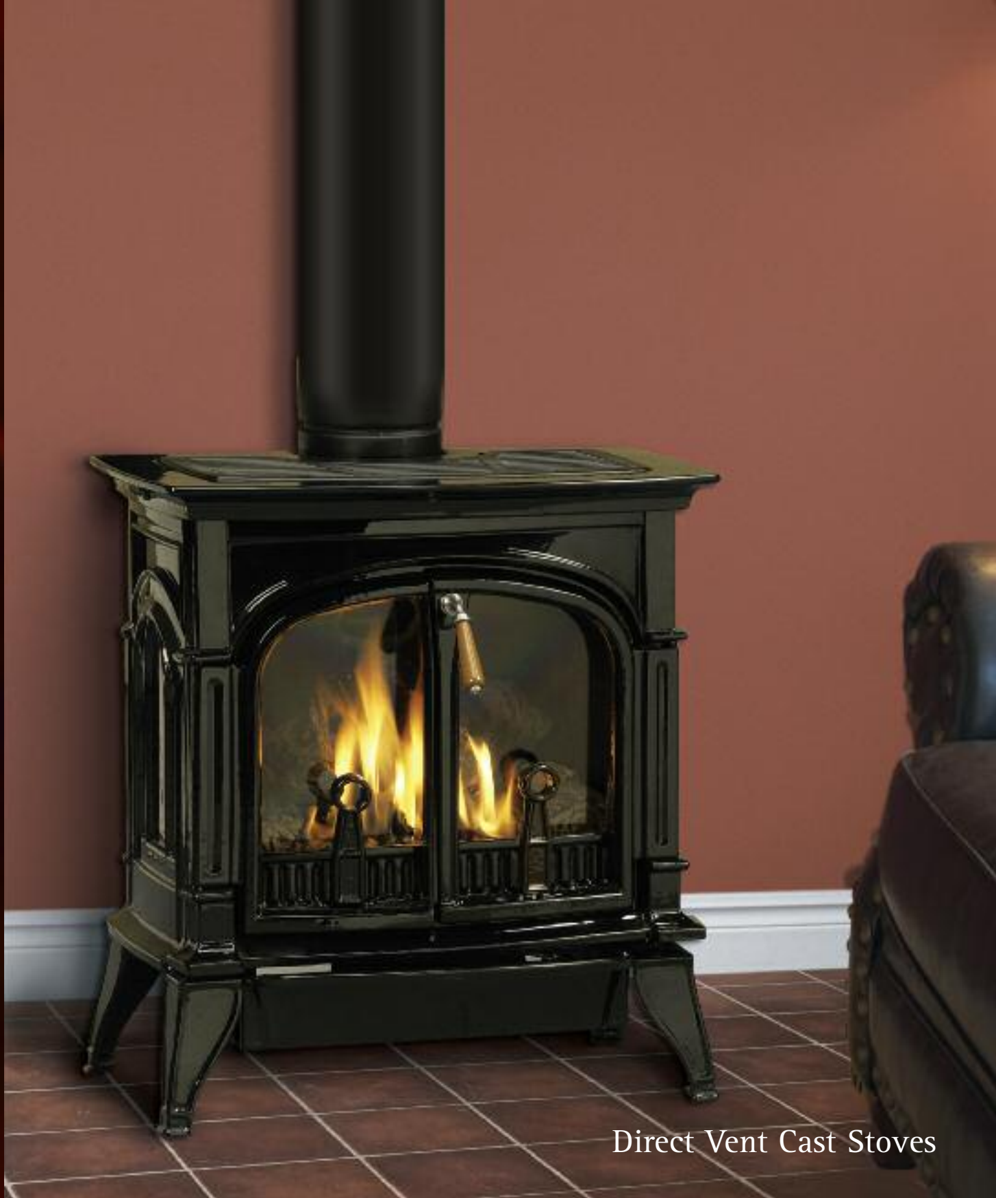
Direct Vent Cast Stoves