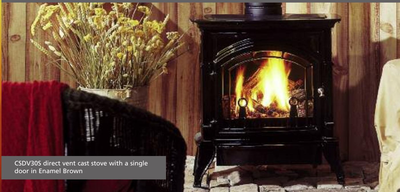
CSDV30S direct vent cast stove with a single door in Enamel Brown

Give people a place to gather – make fire the focal point of your room again with our Direct Vent Cast Stoves from Majestic.