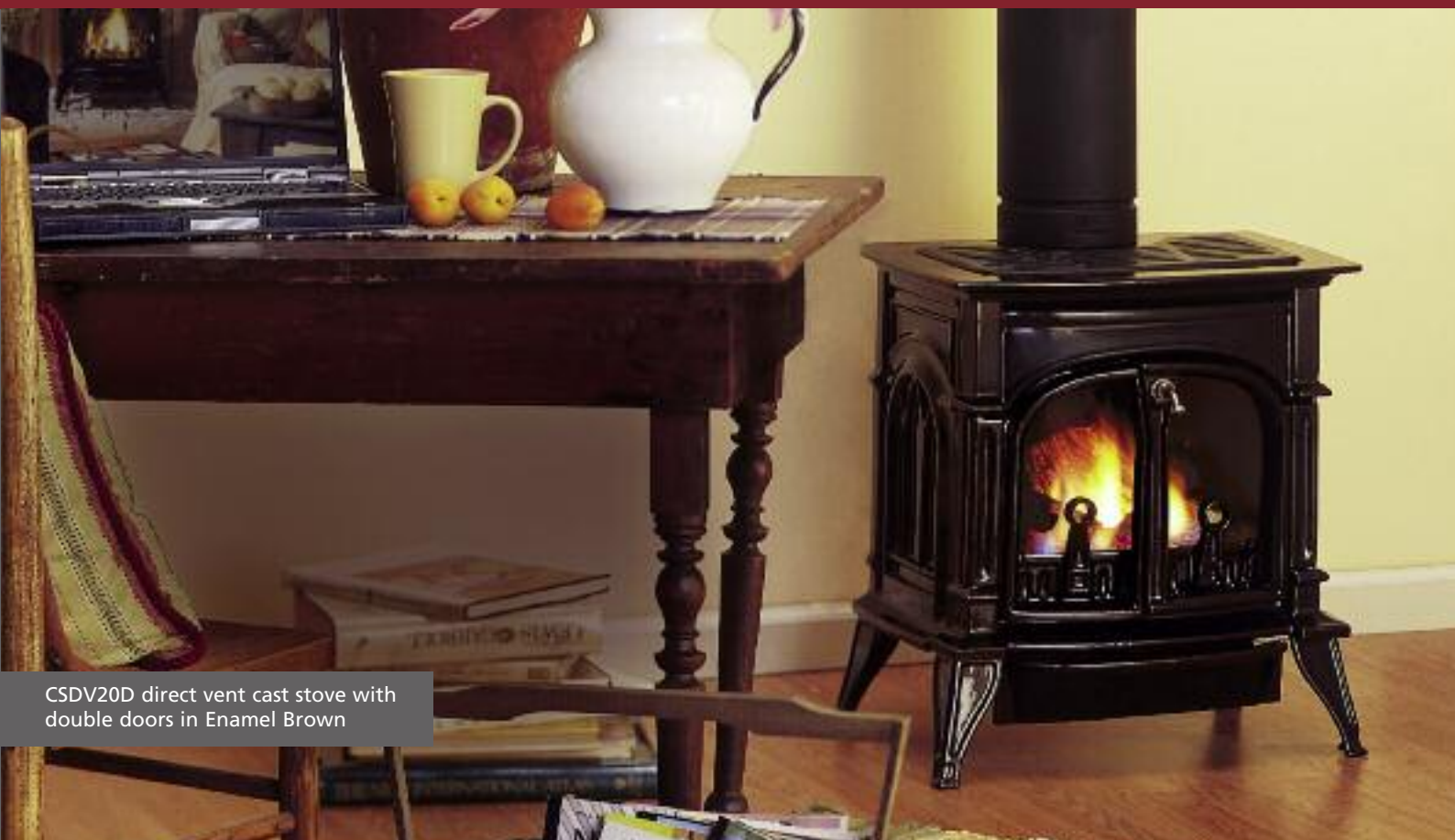
CSDV20D direct vent cast stove with double doors in Enamel Brown