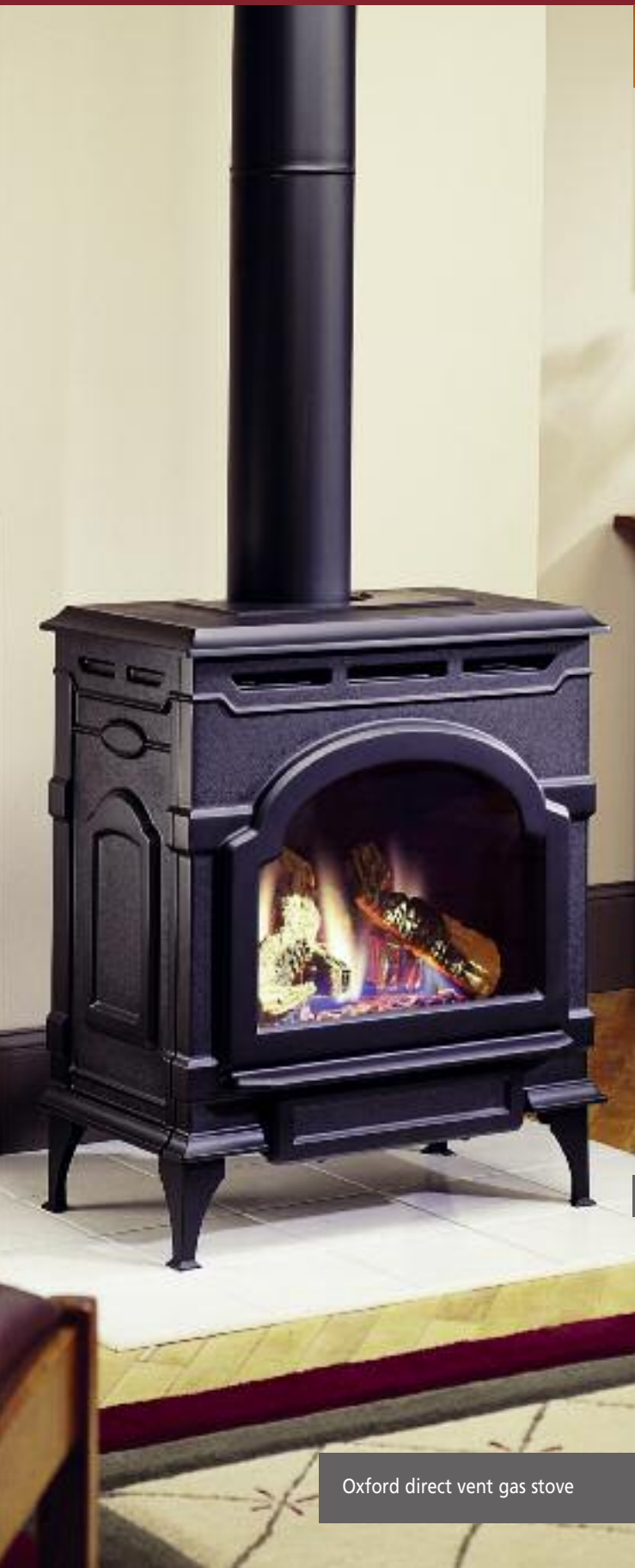
Oxford direct vent gas stove