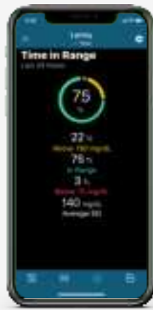
Time in Range