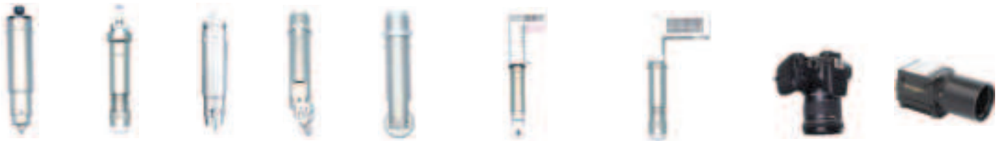
Kiss Cut Knife Tool Pneumatic Knife Tool Drag Knife Tool V-Cut Tool Creasing Tool Driven Rotary Tool High-Power Electric Oscillating Knife Tool Large Format Digital Camera CCD Camera