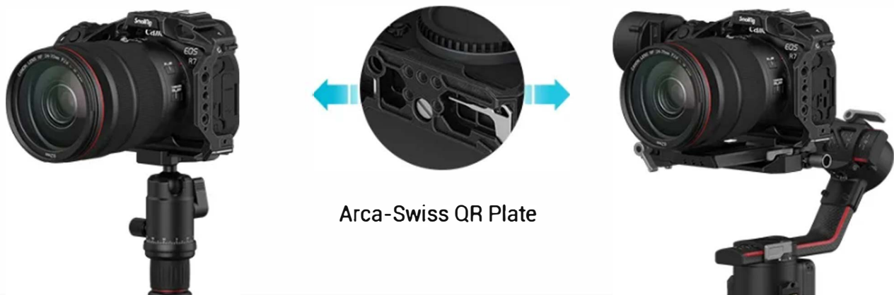
Arca-Swiss QR Plate