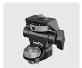
Monitor Mount 2903B