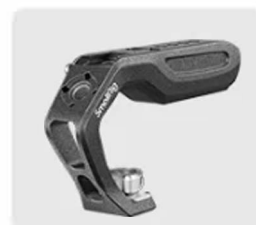
Top Handle 3786