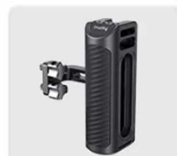
Side Handle HSS2425