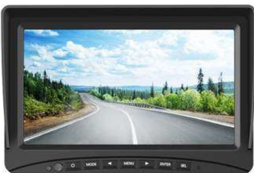
Single full screen

The monitor supports adding 1 to 4 cameras,If you need additional cameras, please contact us.