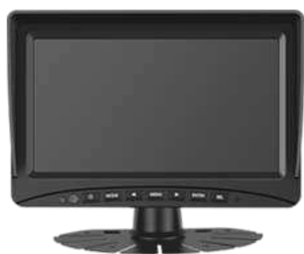
7inch IPS Monitor