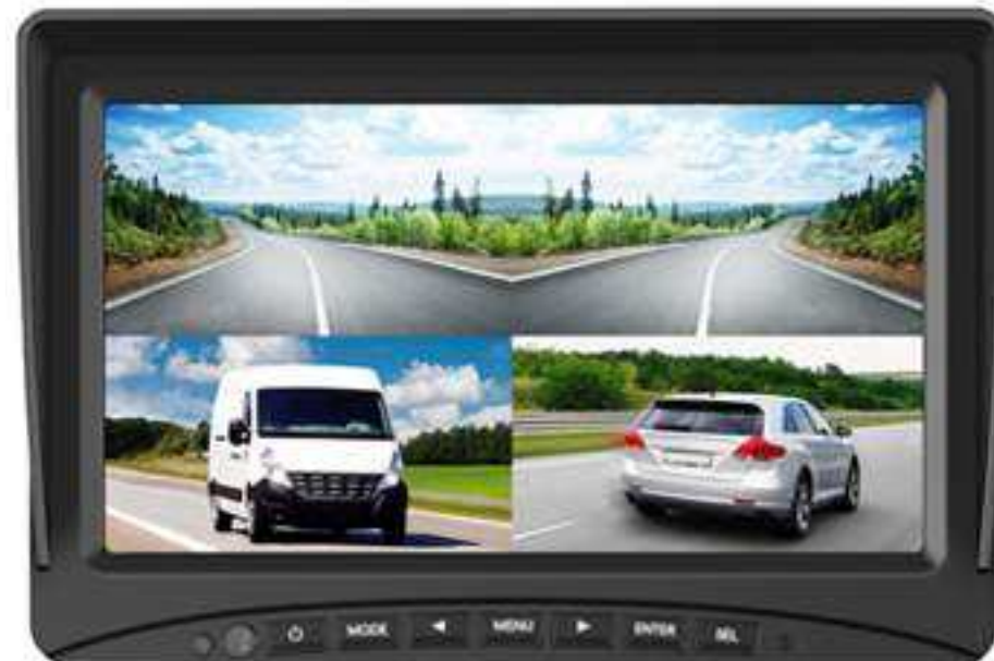
Quad split screen

For example: Select the split screen for CAM1 and CAM2, click "ENTER" to confirm, then click "MENU" to return to the menu home page. First a single screen will appear and you will need to click the "MODE" button to switch screens until the split screen appears.