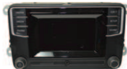
2017 Beetle Radio