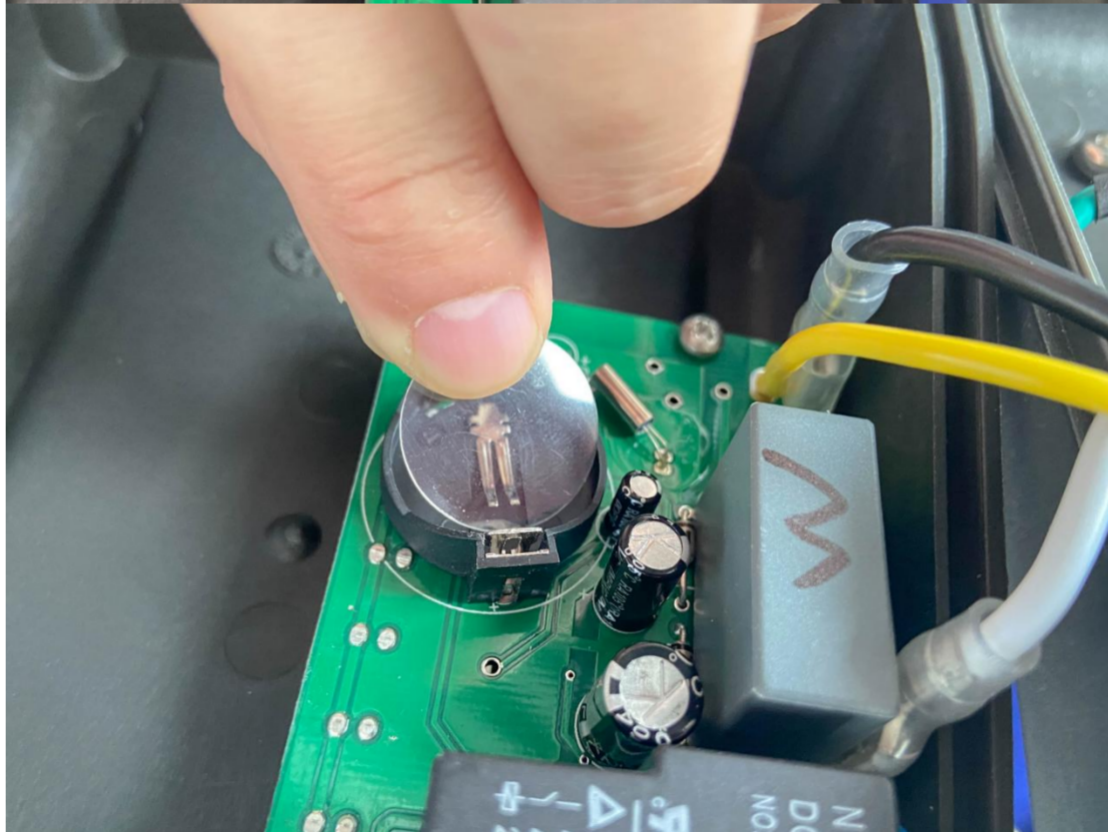
3 Take out the plastic piece under the battery