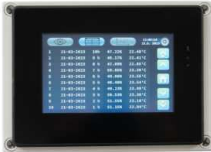
Memory preview screen in the form of a table

The side buttons allow you to view memory data in the memory view screens.