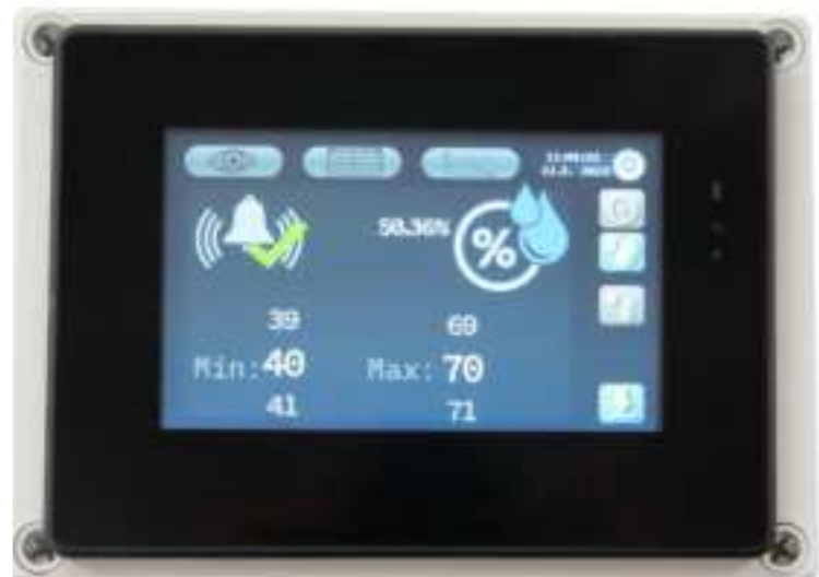
Humidity alarm setting screen

On the alarm screen, pressing the ACK button will turn off the sound signal. Pressing the OK button will cancel the alarm, however, if its cause does not disappear within 1 minute, the alarm will be triggered again