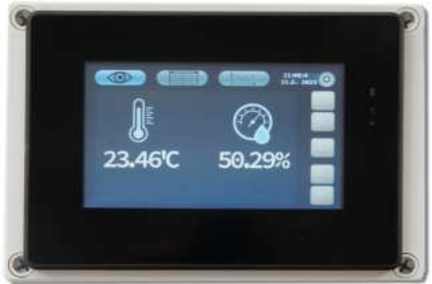
Current readings preview screen