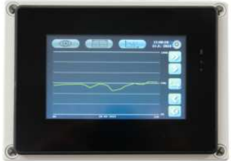
Memory screen in the form of a daily chart - humidity

The side buttons allow you to view memory data in the memory view screens.