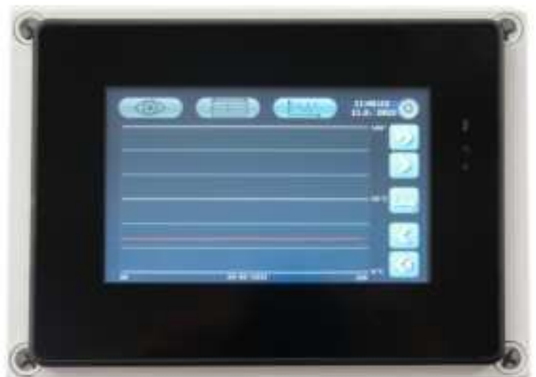
Memory screen in the form of a daily chart - temperature