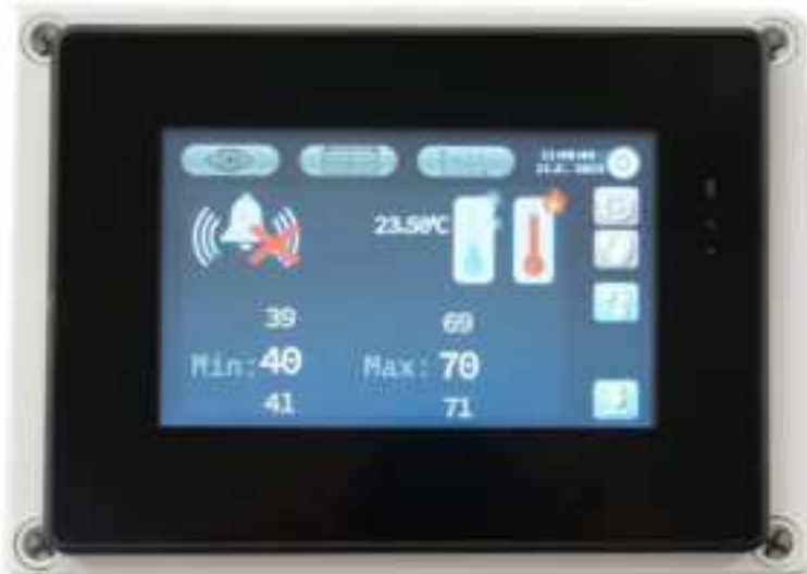
Overtemperature alarm setting screen