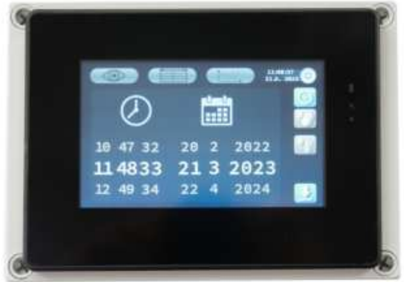
Date and time setting screen

The bell icon indicates whether a particular alarm is on or off. Clicking on it changes its status.