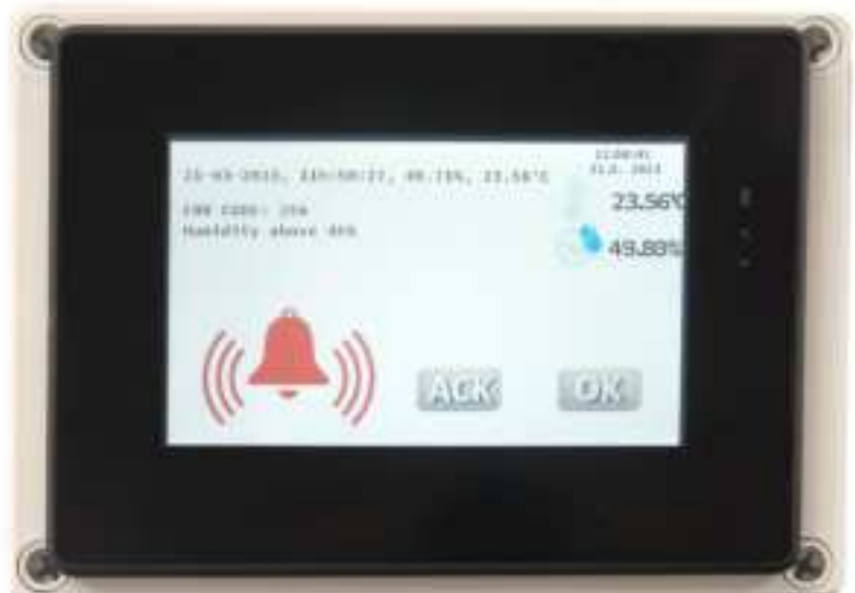
An example of an alarm screen

On the alarm screen, pressing the ACK button will turn off the sound signal. Pressing the OK button will cancel the alarm, however, if its cause does not disappear within 1 minute, the alarm will be triggered again