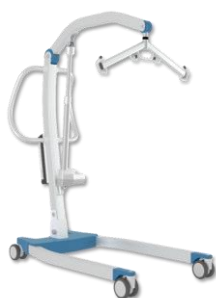
Patient lifter myDIANA