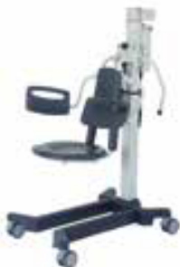
Bath seat lifter NINA