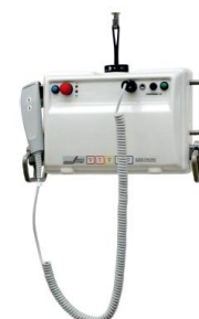
Portable ceiling lift UPL