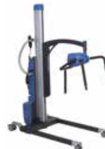
Patient lifter LEXA PRO