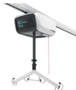
Ceiling lift UNILIFT Pro