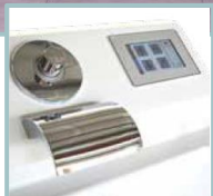
▪ iTub LENA Thermostat Control