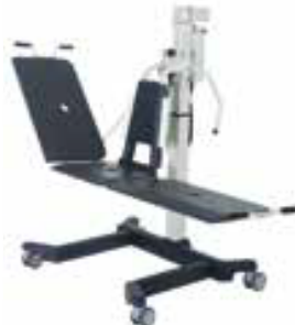
Bathing recliner lifter MONA