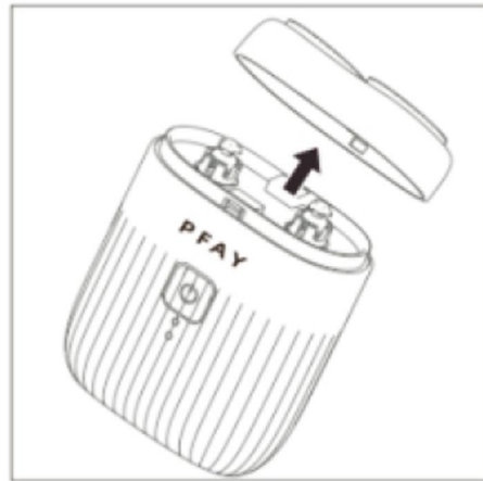
2. The shaver head is a buckle down cover, pull the cover with a fingernail.