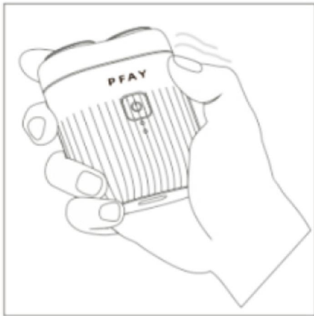
1. Turn off the shaver

To maintain the best performance of the shaver, we suggest to clean it after each shaving.