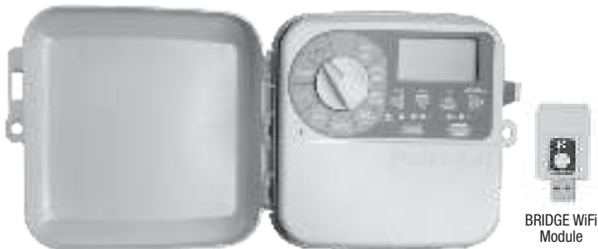
PRO-LC WiFi Controller