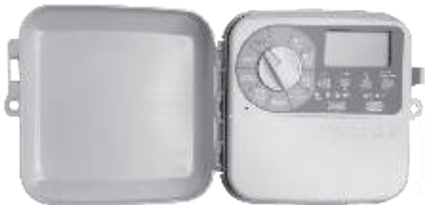
PRO-LC WiFi Controller

Connecting the BRIDGE WiFi Module to the controller and the internet