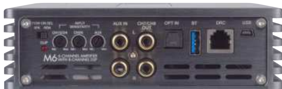
Digital sources can be connected via the optical input or Bluetooth dongle

ket. The sampling rate is 48 kHz, allowing for an audio bandwidth of up to 22 kHz – also a good standard. There are eight DSP channels, so in addition to the six built-in amplifier paths, we find two processed outputs, for example, for subwoofer applications. Three two-channel chips do the amplification; the six amplifier channels are identical, and everything is 2 ohms stable and