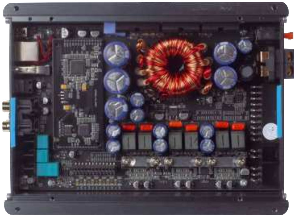
Located on the left of the daughterboard DSP. The jumper for switching between high and low is located at the bottom