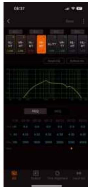
EQ settings in the Android app

bridgeable. Musway promises an increase in power and a general improvement in performance. Among other things, the new Infineon controller is responsible for this, as it controls the “life-supporting” functions of the amplifier. This allows the M6v4 to monitor and adjust temperature, current consumption, undervoltage and overvoltage, power supply function, and impedance.