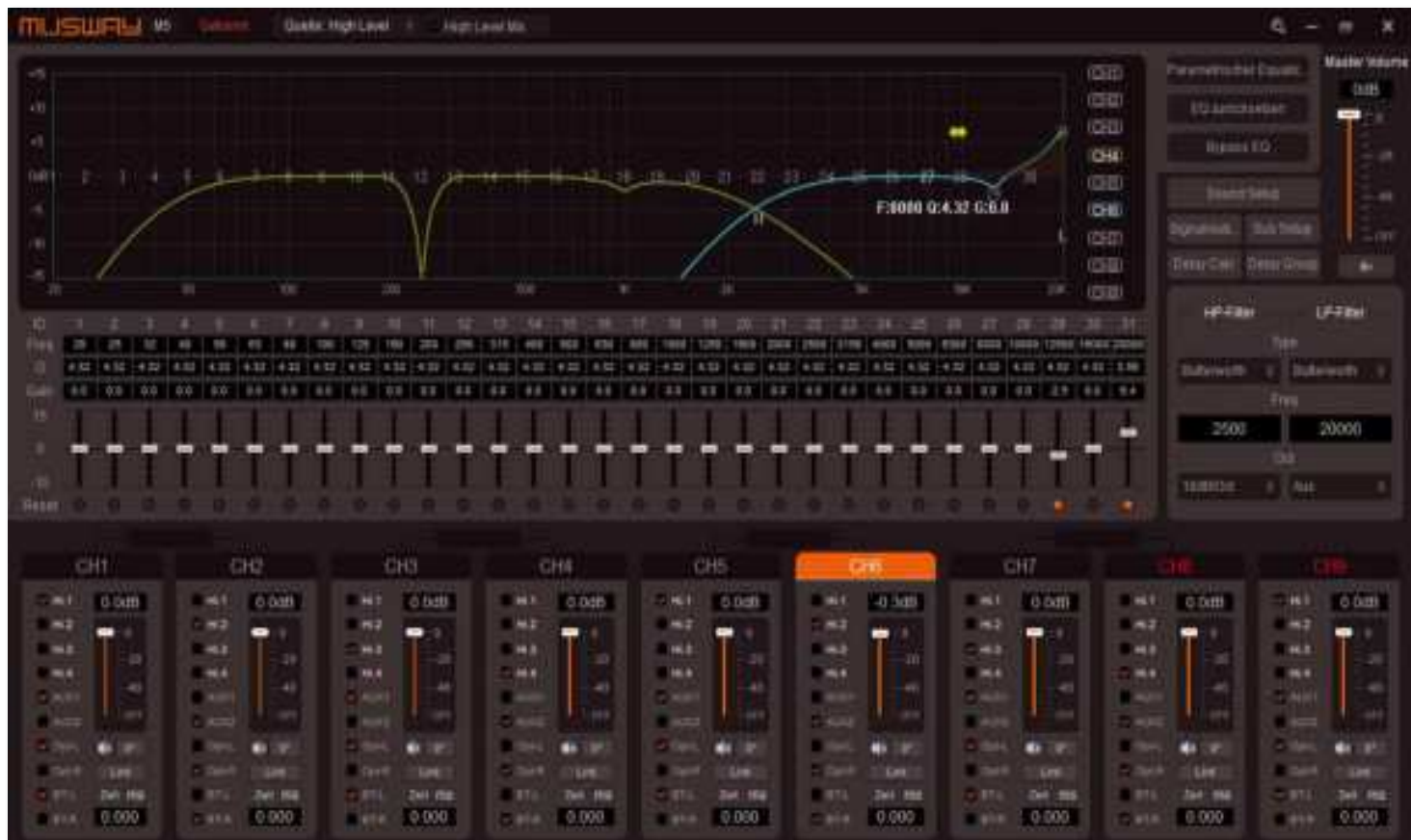
The PC software shows all essential functionality in the main window

In addition to the six line-level inputs, the M6v4 offers a pair of RCA jacks as auxiliary inputs and an optical digital input, which leaves nothing to be desired. Musway sticks to the proven concept when it comes to DSP. The assembly consists of the ADAU1452 as a DSP chip and the combined converter PCM3168A, a proven combination established in many signal processors on the mar-