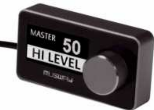
The remote control regulates the master and sub volume, subwoofer groups, and the mute function