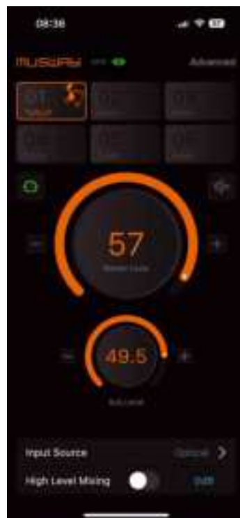
Master and sub levels in the Android app

The M6v4 delivers almost 100 watts at just 4 ohms, and the distortion of 0.015 % is impressively low, especially in the first third of the power range