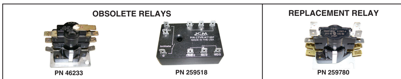
Figure 1. Time Delay Relays