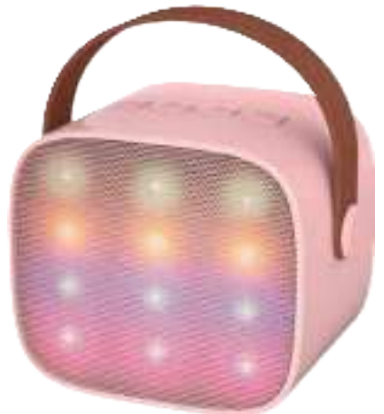
K1-L Karaoke Machine