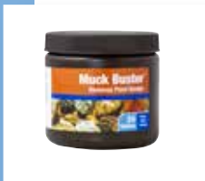
Muck Buster® #PB2682