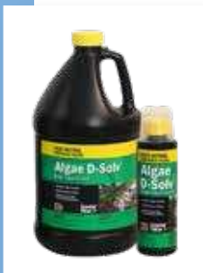
Algae D-Solv® #PB2002