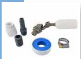
Auto Fill Kit #ABDAUTO