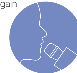
Recommended Microphone Angle

Remove and reinsert the SD card. Push the SD card in and it will pop out