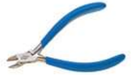
Wire Cutters (or scissors)