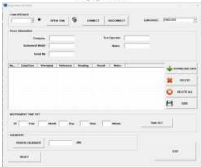
Software Interface (English)