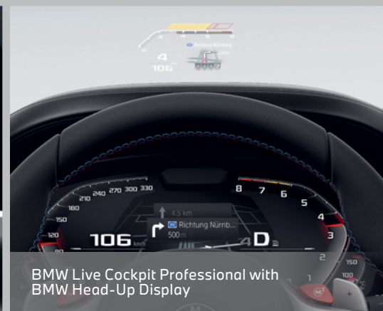
BMW Live Cockpit Professional with BMW Head-Up Display