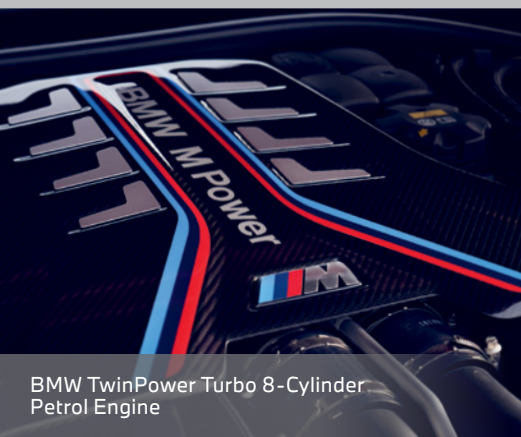
BMW TwinPower Turbo 8-Cylinder Petrol Engine