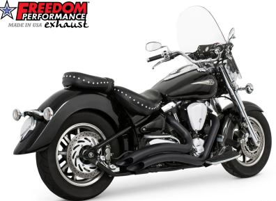
PART # MY00082