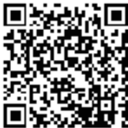
Fosi Audio Product's User Manual

After-sale Service and Technical Support Email: support@fosiaudio.com