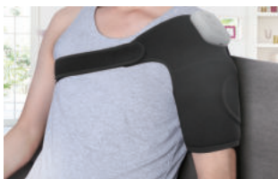
Opt.2 Shoulder Massager(With extension strap)