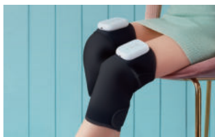
Opt.1 Knee massager

1. Please use the device in the manner shown below: