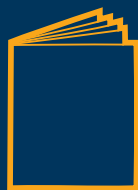
Making Mead Instructional Guide

Thank you very much for buying the Jigger N' Dash Mead Making Kit. We put a lot of effort into formulating this product and we really hope you like it. If you have any questions, please do not hesitate to email us at Hello@JiggerNDash.com or give us a ring at +1 224-402-8599 . Cheers!