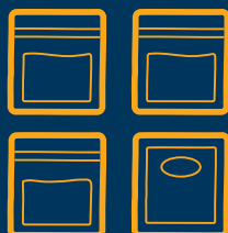
D47 Yeast & Yeast Nutrient Packets 1, 2, 3