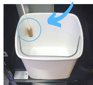
WASTE BUCKET AND FULL WEIGHT