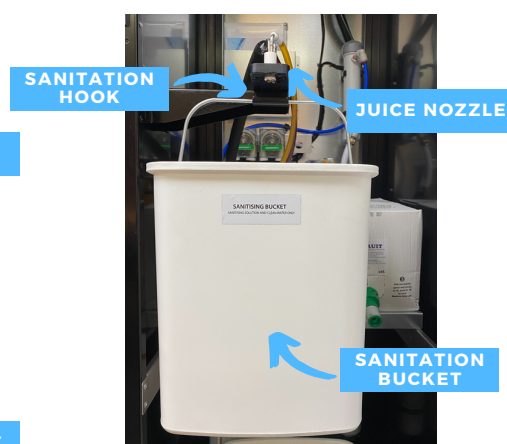
FLUSH WATER / JUICE