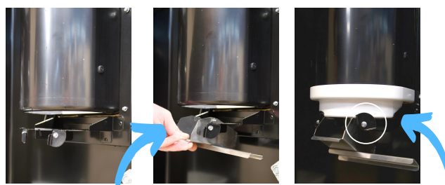
DRIP TRAY CHUTE IN FIRST