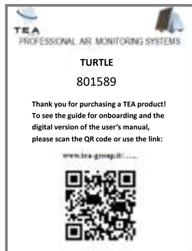
QR code with link to onboarding guide

Items shown here may differ from the original provided in this package. Due to the production process the appearance and colors of images in the manual may differ within reasonable boundaries from the original.