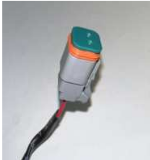
Automatic Reverse Light