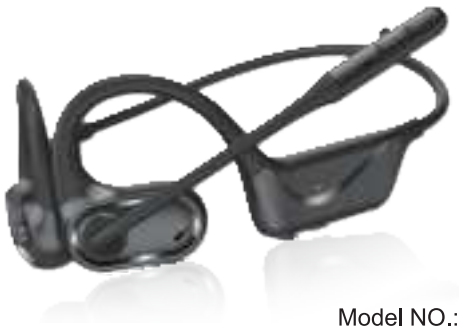
Model NO.: HT03