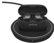
Jabra Elite 75t Wireless Charging -