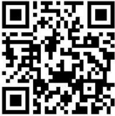
Apple iOS User

A、 Scan the QR code to download and install.