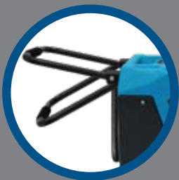
Rigid Handle Design