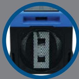
Rolling wheels for easy transportation