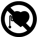
Figure 1. No Pacer Symbol

Cellular Phones. A St. Jude Medical™-designed protective filter in the device prevents cellular phone-generated electromagnetic signals from interfering with the operation of the device. 2