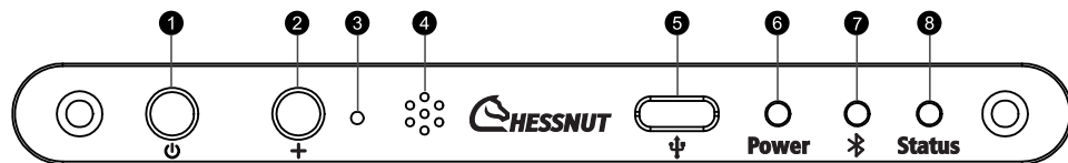
Buttons and Status Lights