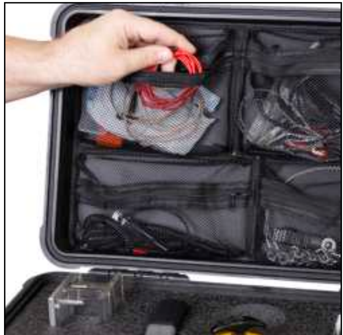
Figure 2. Using the lid organizer

The ESD Program Standard ANSI/ESD S20.20 can be downloaded here: https://www.esda.org/standards/