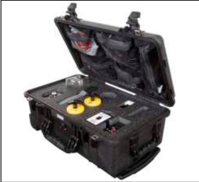
Figure 1. SCS 770129 ESD Compliance Verification Kit