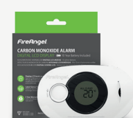
FA3328-EUT 10 Year Sync-It™ (NFC technology) CO Alarm