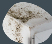
Temperature & humidity sensors for homes learn more >

Environmental insights with FireAngel's innovative solutions suitable for all UK homes