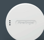
FS2550W2ZB Home Environment Gateway learn more >

Enable remote monitoring with environmental insights (temperature and humidity)