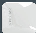
FS1580W2-T Spec Connected Gateway learn more >

Enable remote monitoring, real-time status updates and view instant diagnostics reports