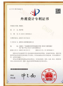
Design patent Patent No.:ZL201930555136.2