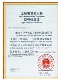
SRRC certification CMIIT ID:2020AP14816