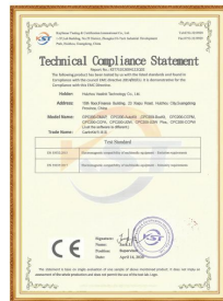
CE certification Report No.:KST752E2004122Q02