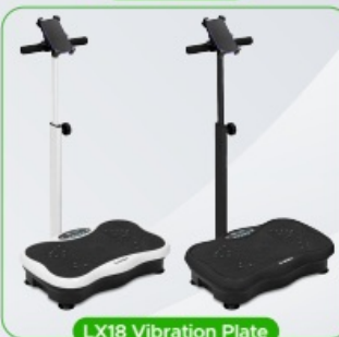
LX18 Vibration Plate