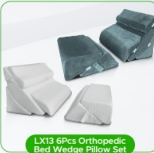
LX13 6Pcs Orthopedic Bed Wedge Pillow Set