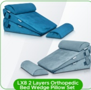
LX8 2 Layers Orthopedic Bed Wedge Pillow Set