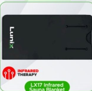
LX17 Infrared Sauna Blanket