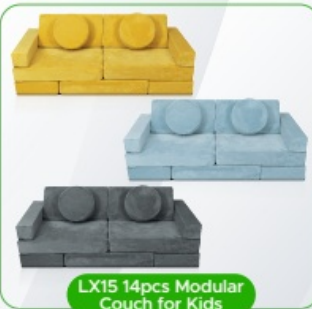
LX15 14pcs Modular Couch for Kids