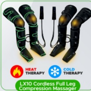
LX10 Cordless Full Leg Compression Massager