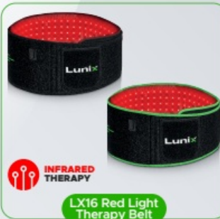
LX16 Red Light Therapy Belt