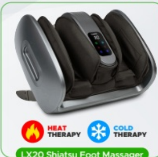
LX20 Shiatsu Foot Massager