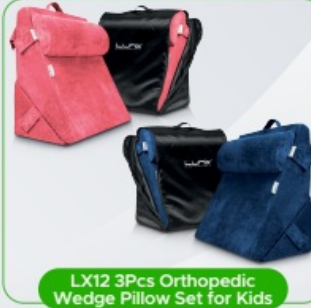
LX12 3Pcs Orthopedic Wedge Pillow Set for Kids