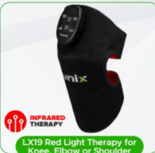
LX19 Red Light Therapy for Knee, Elbow or Shoulder