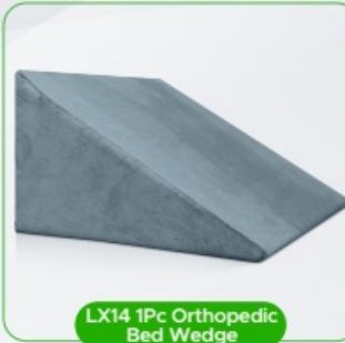
LX14 1Pc Orthopedic Bed Wedge