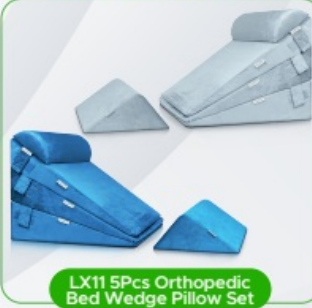
LX11 5Pcs Orthopedic Bed Wedge Pillow Set