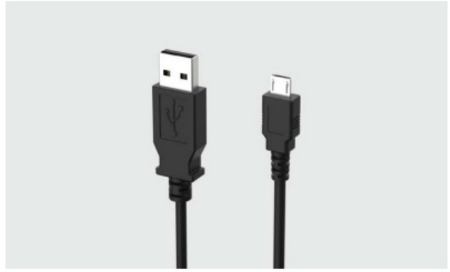
USB Micro-B Cable