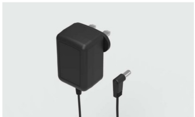
9V/1A Power Supply (Includes Charger Body and Plug Head)