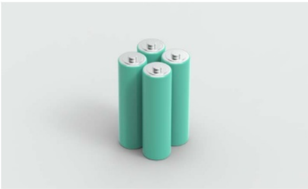
4x Single Cell rechargeable batteries (1.2V NiMH, AA Cells)