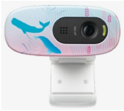
Boost moods with inclusive tech use