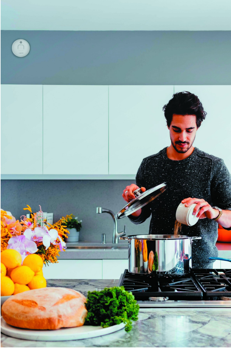
Great for Home Safety