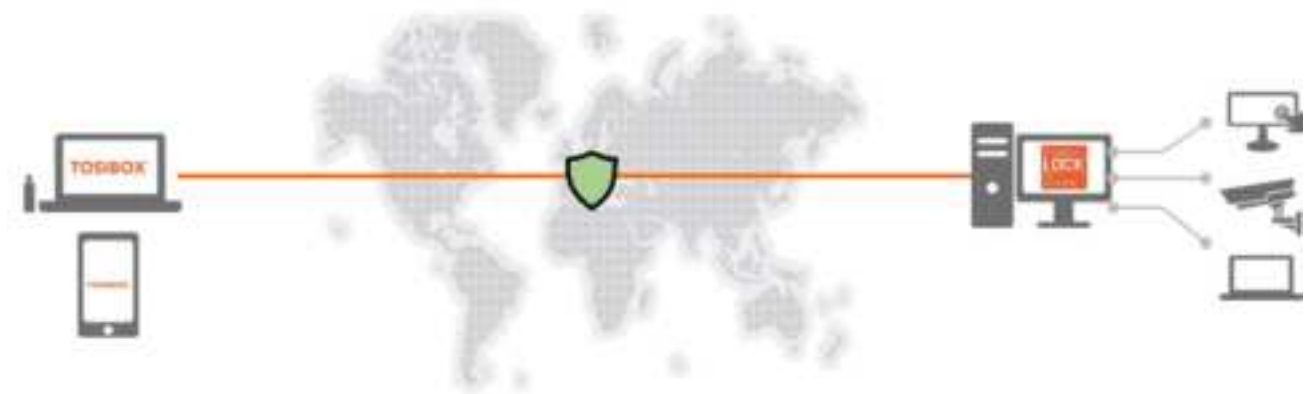
Figure 2: Connectivity from TOSIBOX® Key Client to devices behind TOSIBOX® Lock for Container

This option is well suited for remote management of the host device itself and the local network. It also suits well for the mobile workforce.