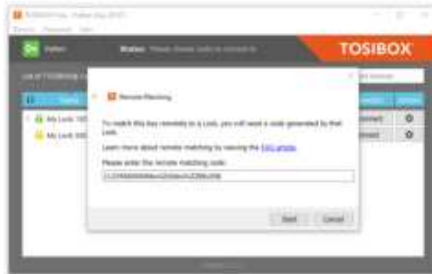
Figure 7: Remote Matching on TOSIBOX® Key Client

Log in with your credentials and go to Devices > Remote Matching.