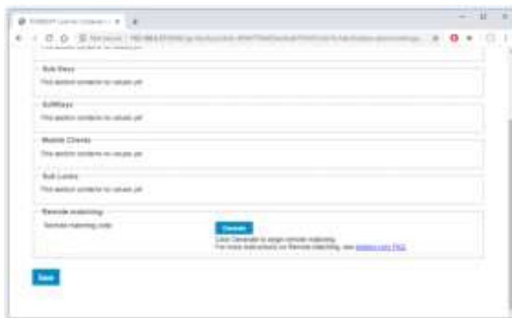
Figure 6: Remote Matching Code generation page