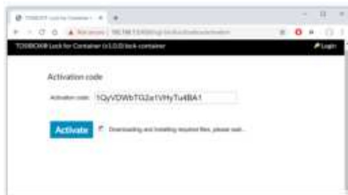
Figure 5: TOSIBOX® Lock for Container activation page