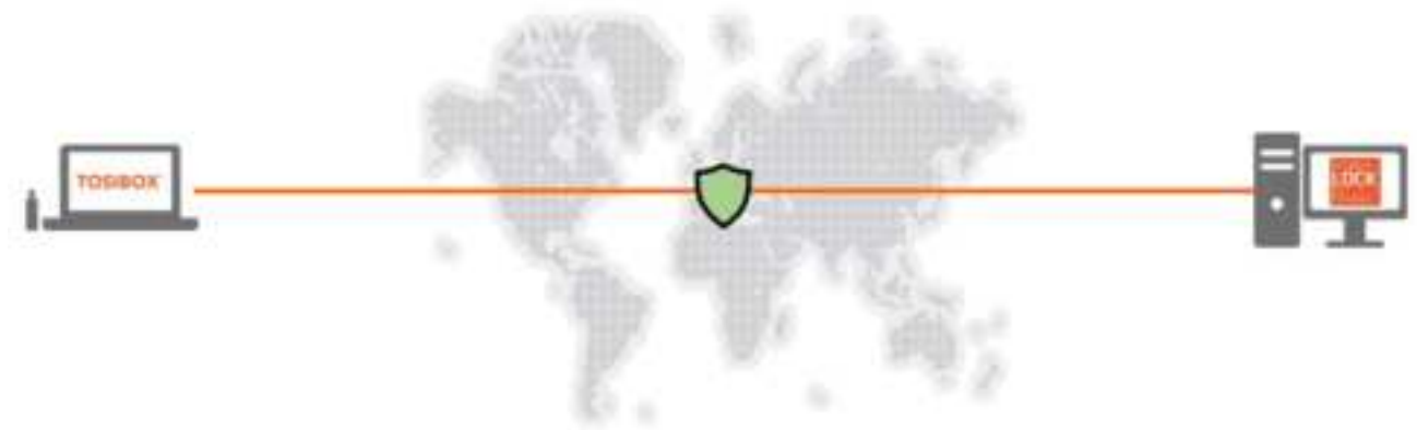
Figure 1: Connectivity from TOSIBOX® Key Client to the host device or the Docker network within the host device

This option is well suited for remote management of the host device or the Docker containers on the host device.