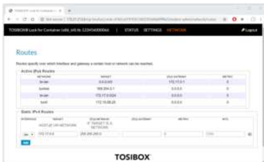
Figure 9: Static route