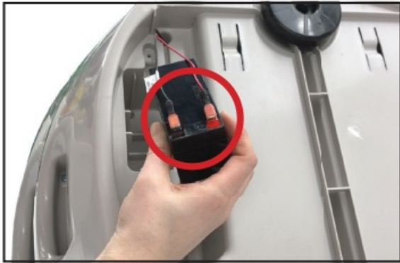
Connect leads to terminals according unit's serial number