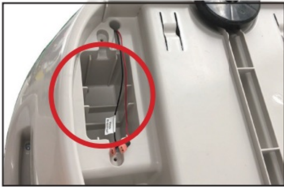
Battery pocket on underside of Base with leads