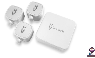
Linkstyle TOCABOT Smart Switch Bot Button Pusher