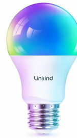
Linkind A19 Smart Light Bulb