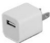
Smart phone's USB charger