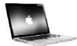
Laptop's USB charger

NOTE: By plugging in USB, the timer will be reset to original setting. When switch back toWith battery power, the timer will be reset again.