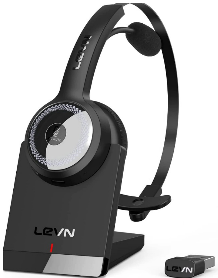
Bluetooth Headset, LEVN Wireless Headset with Microphone headphones