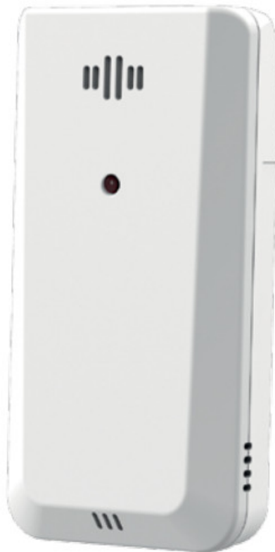
LS10 Weezer Sensor for Weather Stations User Manual