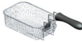
Frying basket with cool-touch handle

Drain support, dishwasher safe. Do not fill the basket with food more than halfway full