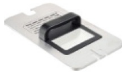
Lid with viewing window & odour-reducing filter