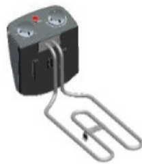
Submergible heating element with control knobs & power light Do not immerse in water.

Drain support, dishwasher safe. Do not fill the basket with food more than halfway full