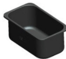
Enamelled oil container MAX and MIN level marking on the inside. Dishwasher safe.

Indicator Light This light will cycle ON and OFF as the thermostat operates to maintain the correct oil temperature.