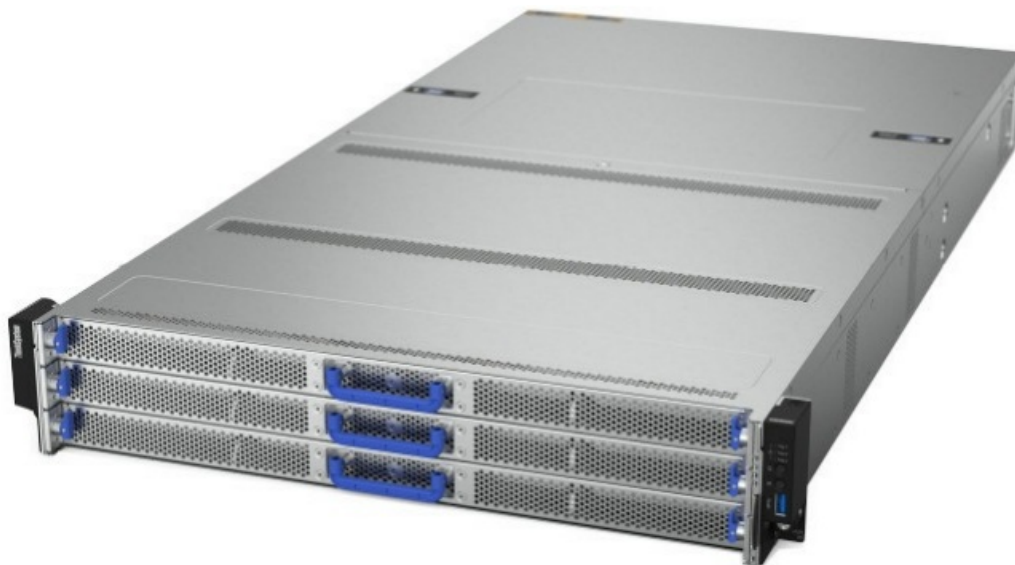
Figure 1. Lenovo ThinkSystem Ready Node HS350X V3

This document is a quick reference for how to support and manage the ThinkSystem Ready Node HS350X V3 platform. We provide references to the documentation as well as a brief summary of how to leverage it, all in one location, so that customers, partners and field technicians can educate themselves and better support the product.