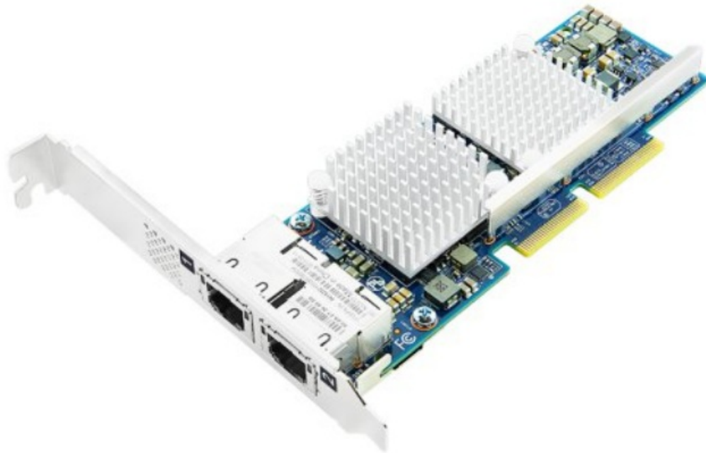
Figure 2. Broadcom NetXtreme II ML2 Dual Port 10GbaseT for System x

Figure 2 shows the Broadcom NetXtreme II ML2 Dual Port 10GbaseT adapter.