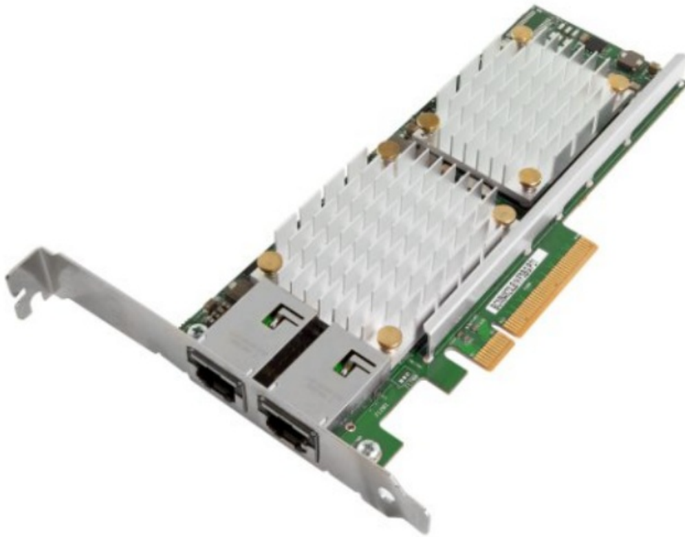
Figure 3. Broadcom NetXtreme II Dual Port 10GBaseT Adapter for System x

The Broadcom NetXtreme II ML2 Dual Port 10GbaseT is a special mezzanine LAN-on-motherboard (mezzanine LOM) form factor adapter that also supports the Network Controller Sideband Interface (NC-SI) for communication with the server's onboard IMM2 management processor. This support enables sharing the network interface with the IMM2 and the operating system, thereby eliminating the need for a separate management network. The following figure shows the Broadcom NetXtreme II Dual Port 10GBaseT Adapter.